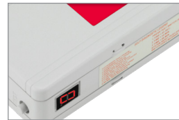
Numeric Indicator for dependable visual status and fault detection. Only available with G2-NI option.

Illumination: Long-life, high-intensity, red or green LEDs Housing: Rugged, injection-molded UL 94 5VA flame-retardant, high-temperature thermoplastic housing Input: 120/277VAC dual primary, 60Hz Battery: Maintenance-free NiCad battery Run Time: UL Listed 90 minute emergency run time, 24 hour recharge time Legend: Fully-illuminated 6" characters with 3/4" stroke and field-selectable directional chevrons Mounting: Ceiling, end or wall mounted, canopy included Finishes: Black or White Options: 220 = 220VAC, 50Hz Input G2 = Self-test/Self-diagnostics G2-NI = Self-test/Self-diagnostics with Numeric Indicator and Battery Access Door USA = Meets Buy America Requirements Certifications: UL Listed for Damp Locations and meets or exceeds the following: NEC requirements and NFPA 101. California Energy Commission (CEC) compliant Warranty: Any component that fails due to a manufacturing defect is guaranteed for five years with a separate five year prorated warranty on the battery. The warranty does not cover physical damage, abuse or instances of uncontrollable natural forces. See the full Exitronix warranty document for detailed information. (Terms and Conditions apply)