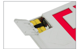
Tool-less hinged door for easy and safe access to isolated low voltage battery compartment. Only available with G2-NI option.