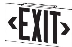
Ceiling Mount Option