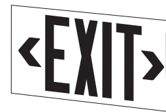
Flag Mount Option