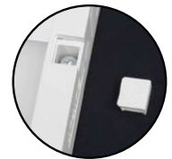
Pre-positioned installation screws