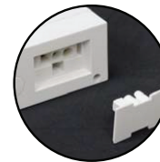
Link several undercabinets together with the linkable connector wire