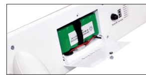
Tool-less hinged door for easy and safe access to isolated low voltage battery compartment.