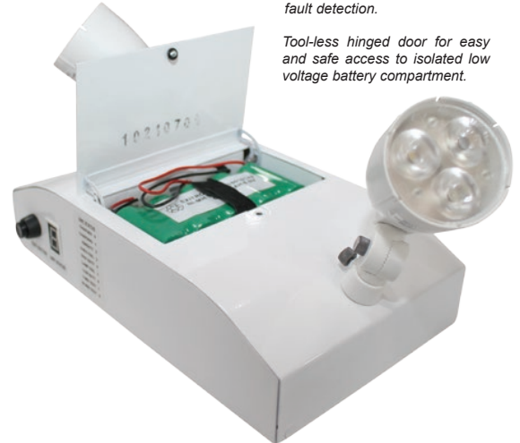
Tool-less hinged door for easy and safe access to isolated low voltage battery compartment.