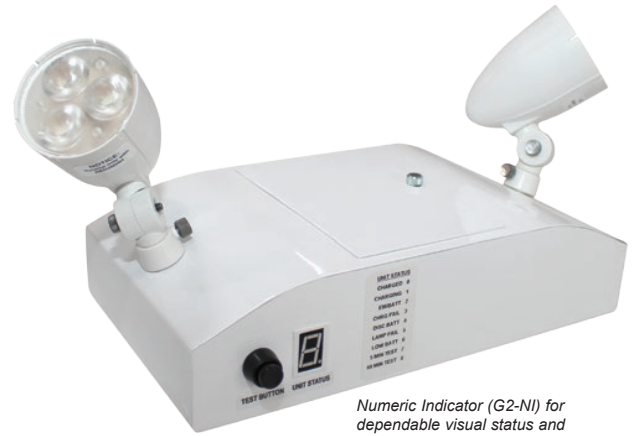
Numeric Indicator (G2-NI) for dependable visual status and fault detection.