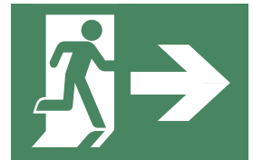
Arrow Right (1 pc)