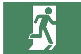
Without Arrow (2 pcs)