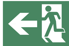
Arrow Left (1 pc)

The RMPC provides two pictograms with no directional indicators, a pictogram with a left facing directional indicator and a pictogram with a right facing directional indicator, as well as a one blank panel.